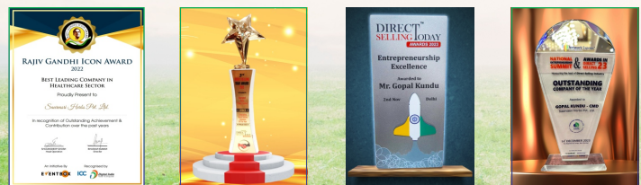
Rajiv Gandhi Icon Award Emerging Company of the Year 2022 Entrepreneurship Excellence Award Outstanding Company 2023

Apart from winning the hearts of our valued customers, we take pride in our corporate achievements too. We are recognized with many prestigious awards & recognitions.