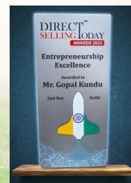
Entrepreneurship Excellence Award