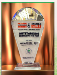
Outstanding Company 2023