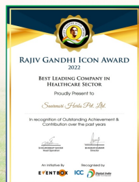
Rajiv Gandhi Icon Award

Apart from winning the hearts of our valued customers, we take pride in our corporate achievements too. We are recognized with many prestigious awards & recognitions.