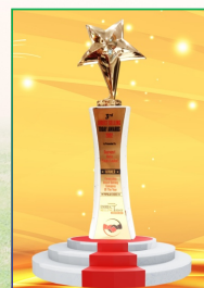
Emerging Company of the Year 2022