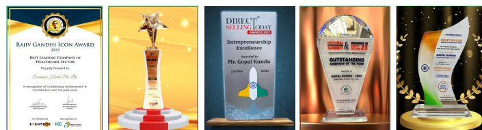
Rajiv Gandhi Icon Award

Apart from winning the hearts of our valued customers, we take pride in our corporate achievements too. We are recognized with many prestigious awards & recognitions.